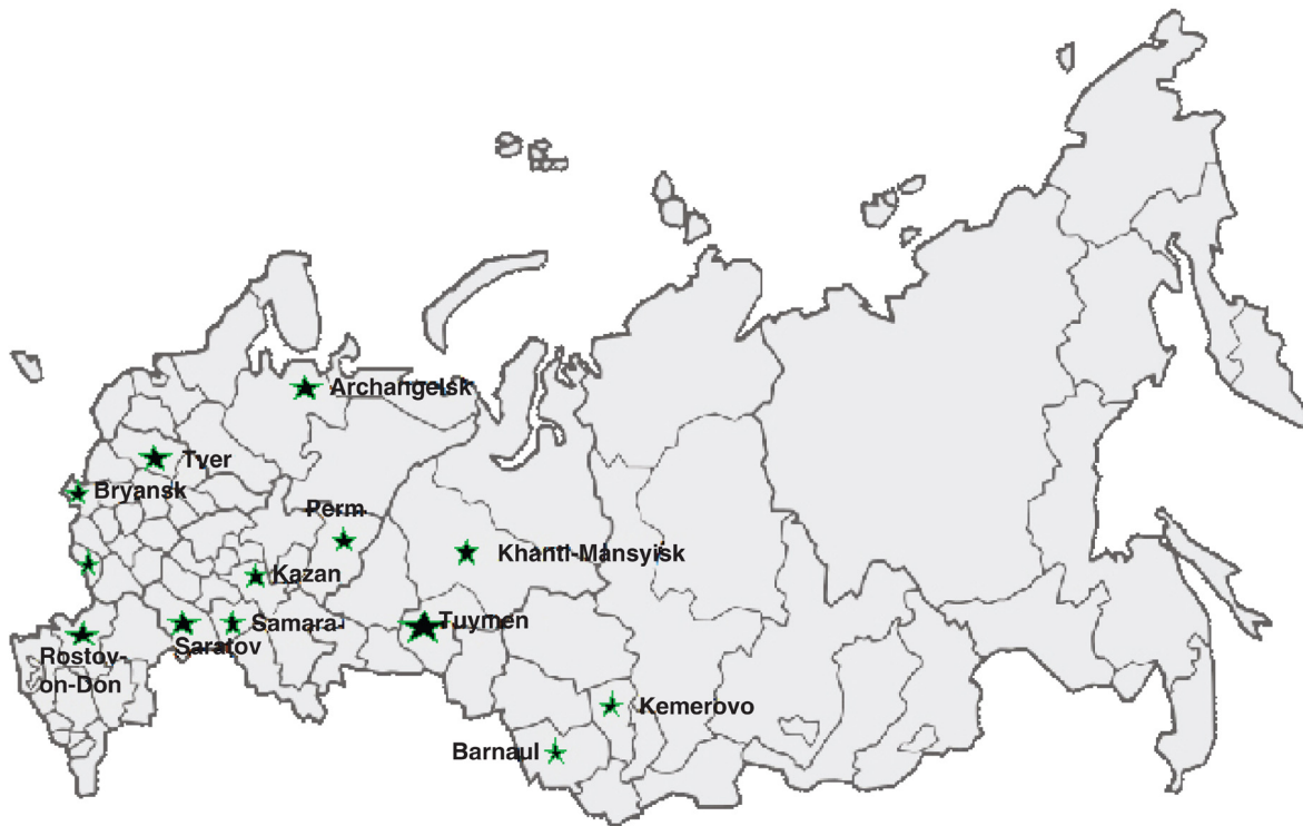
Figure 2. Location of participating centres in the management of acute myocardial infarction in Russian Federation.

is considerable variation in levels of activity, patient characteristics and patient outcomes across these 13 hospitals. For example, the proportion of patients with AMI admitted within 24 hours of symptoms ranges from 28.4% to 92.5%.