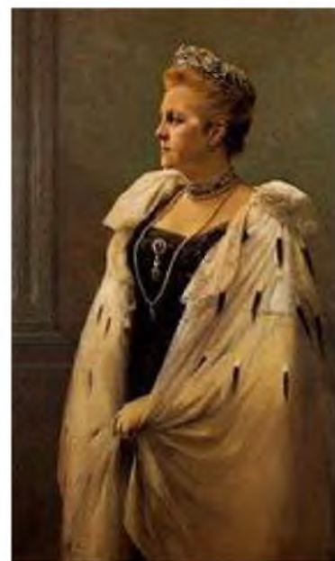
Pictures 3, 4: The King George I & the Queen Olga. ( http://www.ime.gr/chronos/13/gr/general/gallery/domestic_policy/004.html & http://el.wiki.org , accessed 24.05.2015).