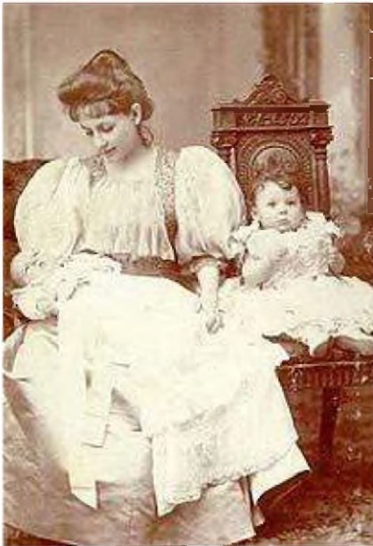
Picture 1: Penelope Delta, age 33, holding her baby daughter