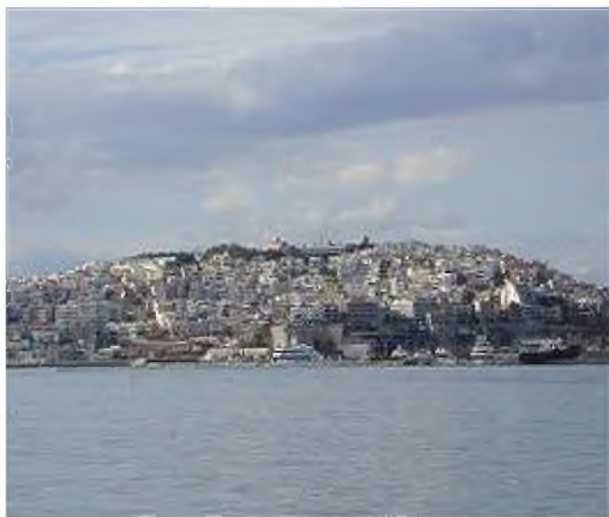
Picture 5: Kastela of Peiraeus today.

Combining the school subjects can be a very creative and interesting teaching technique. So, geography can also be combined with this text. The students can search the position of Greece on maps and specifically, the region of Kastela in Piraeus, where the heroes were supposed to live.